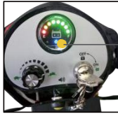
Fault Display LED